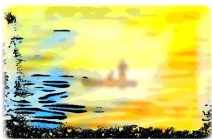
Love coming back into focus, uncertain but no longer adrift.

Participants tell their stories to each other using words and the images they create. Some participants find that they can express in pictures, what they find hard to share in words.