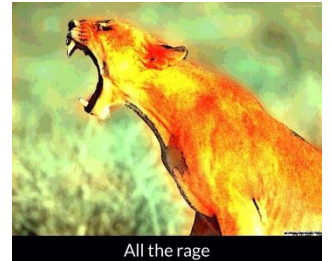
All the rage